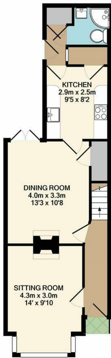
GROUND FLOOR APPROX. FLOOR AREA 44.1 SQ.M. (475 SQ.FT.)